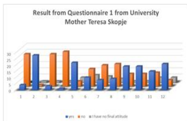
Figure 2. Results from MT

Now we will show the results from University Mother Teresa - Skopje. The results for Questionnaire1 from University Mother Teresa Skopje are given in Fig.2.