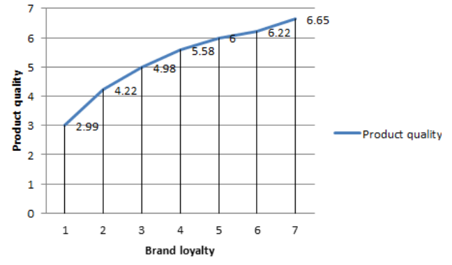
Figure 3: Correlation of product quality and brand loyalty