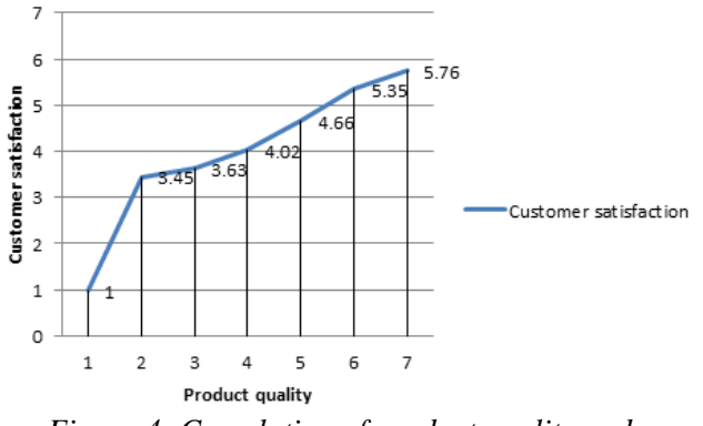
Figure 4: Correlation of product quality and customer satisfaction

As a result, the main hypothesis H_0 : Increasing the intensity of promotional activities, increases customer satisfaction can't be rejected while the alternate hypothesis H_a : Increasing promotional activities, doesn't affect customer satisfaction is rejected.